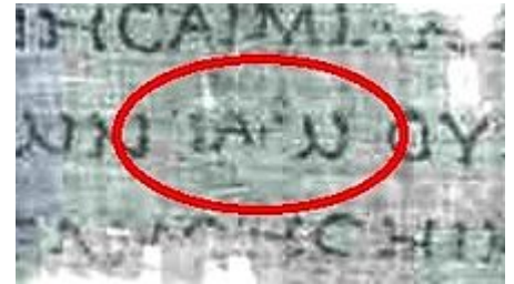
Detail: the Divine Name in verse 27